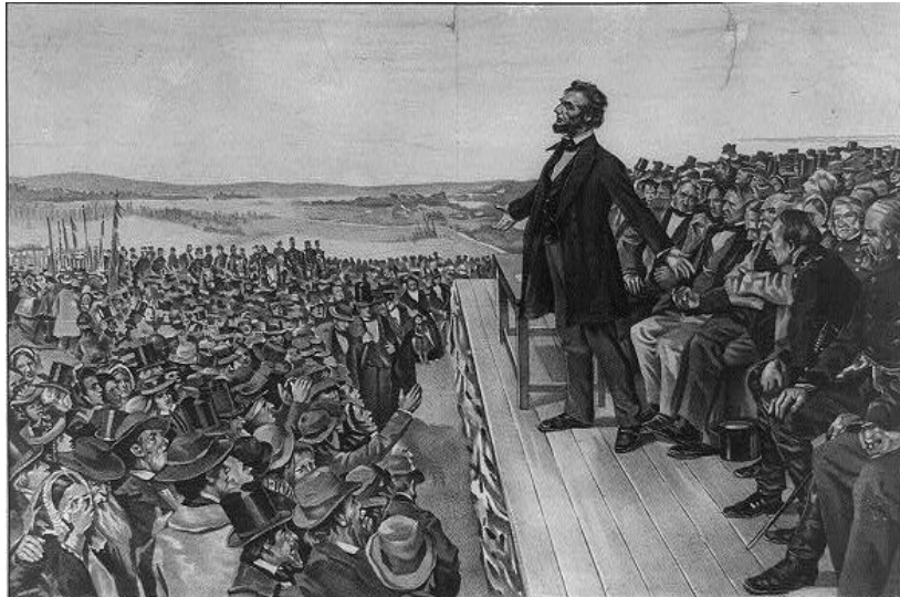
Illustration of Lincoln Giving the Gettysburg Address